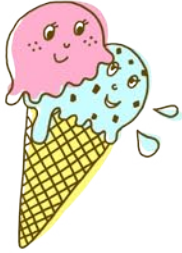
I ice cream